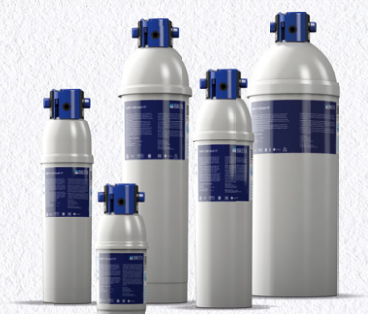
PURITY C Quell ST