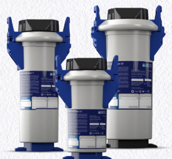
PURITY Quell ST

This is an overview of the complete range of PURITY filtration products, designed specifically for use in vending machines. BRITA Professional has the right solution for you, providing the ideal water for your needs – no matter what the composition of your mains supply.